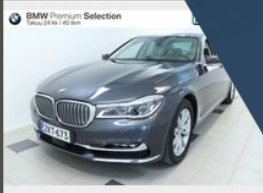
BMW 7-sarja 740 d A xDrive... 2016, 57000 km, 79900 €