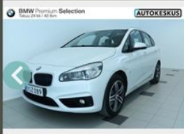
BMW 2-sarja 225 xe Active ... 2017, 38000 km, 30790 €